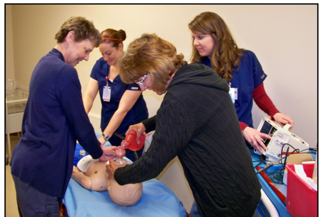
Cass Regional nurses improve clinical skills by using the pediatric patient simulator.