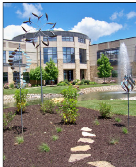
Wind Sculptures in the Healing Garden at Cass Regional