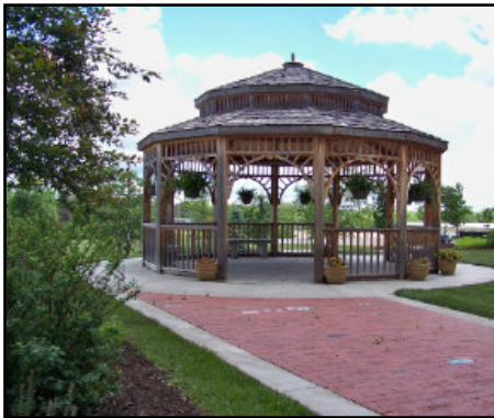
Memorial Brick Path

As Memorial Day approaches, we are reminded of loved ones and friends we have lost through the years, as well as those who have made an impact on Cass Regional. Several donors have chosen to place an engraved brick or bench in our