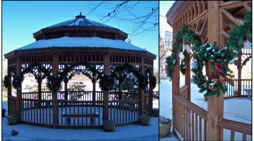
The gazebo provided a beautiful space to display donors' holiday messages.

Cass Regional Foundation sincerely thanks each of you who chose to participate. May the new year be a happy and healthy one for you and your loved ones!